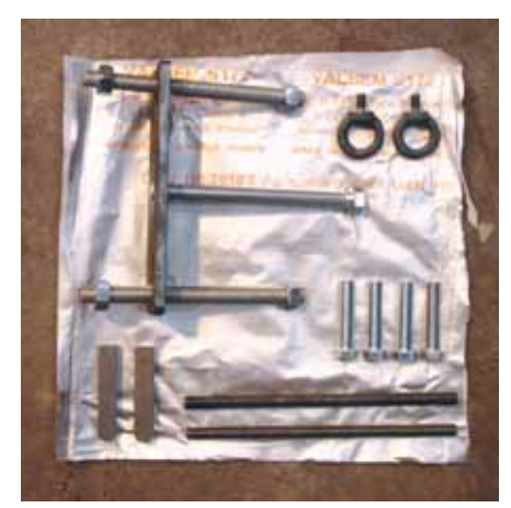
* All required accessories and tools are included in the package.