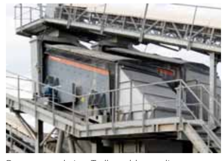
Dust encapsulation, Trellex rubber sealing

The Nordberg CVB screens are used for secondary, final sizing or even primary applications.