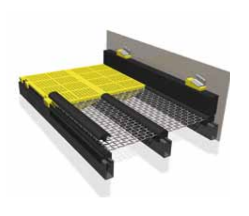
Trellex LS modular solution consist of standard modules in both polyurethane and rubber compounds for different application needs. For specific and common screening application needs, LS system also offers a high performance range; Trellex LS HiPer Life, Trellex LS HiPer Flow and Trellex LS HiPer Clean.