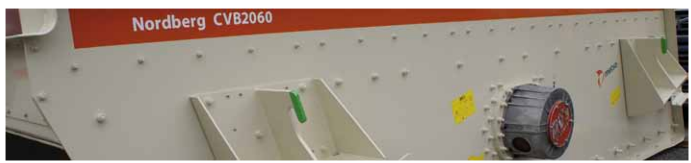
Components assembled with huck bolts