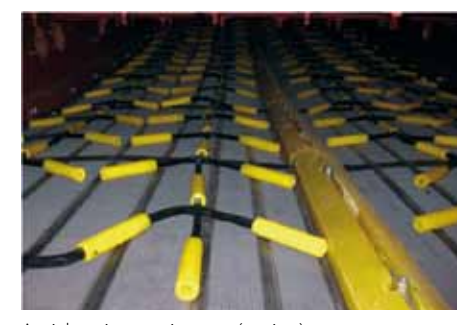
Anticlogging equipment (option)